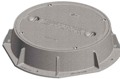
Illustrating 1812Z2 frame with optional bolted watertite 2812 cover

Options Recessed stainless steel hex bolts or special security bolts Special lettered covers Watertite assembly Gasket seal covers Drainage grate — 1580