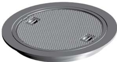
2812 4 1/2" top flange frame and cover